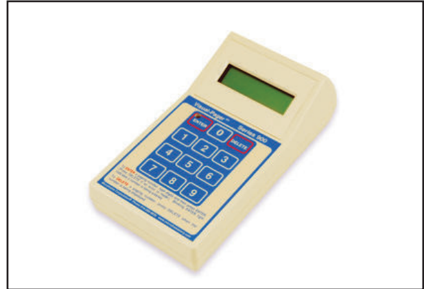
Microframe® Model 910 Keypad

In 6-Digit mode the keypad will show numbers from 0 to 999999. This mode is compatible with 960 Remote Displays.