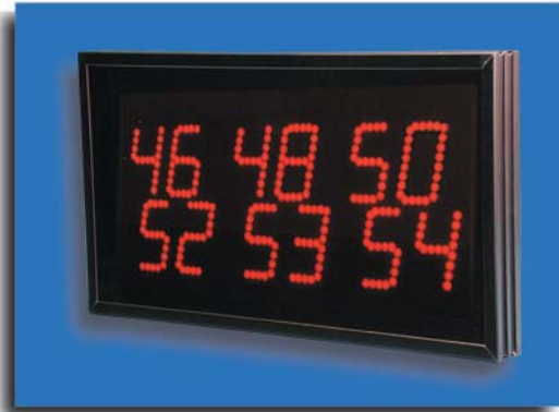
Microframe® Model 9620 Display

The Model 9620 Remote Display is designed to operate with the Microframe Model 4060 or 9060 Keypad. The signal and power is received from a single cable connected to the Keypad. Up to four displays may be connected directly to the Keypad.