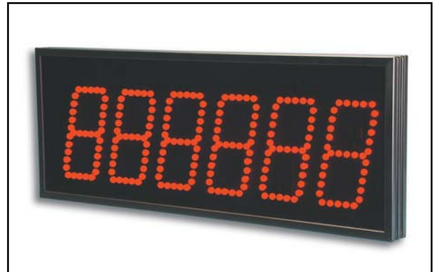
Microframe® Model 960 Display

The 920, 930, 940 and 960 Remote Displays are designed to operate with the Model 906 Keypad or Model 6200 Timer Keypad. The Remote Display receives power and signal from a single cable connected to the Keypad and is turned on or off with the Keypad power switch.