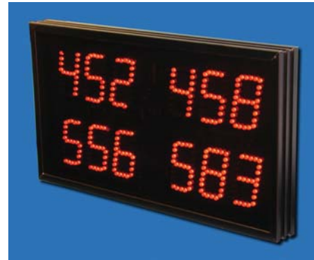
Microframe® Model 9430 Display

The Model 9430 Remote Display is designed to operate with the Microframe Model 9040 Keypad to provide a continually refreshed Remote Display of up to 32 different 3-digit numbers from 000 to 999. The signal and power is received from a single cable connected to the Model 9040 Keypad. Up to four displays may be connected directly to the Model 9040 Keypad.