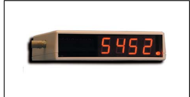
Microframe® Model 941 and 942 Displays

The Model 941 Desktop Remote Display is designed to operate with the Microframe Model 6200 Timer or Model 904 Keypad to provide a Remote Display of data entered into these products. The Model 941 Display receives its power and signal from a single cable connected to the Keypad and is turned on or off with the Keypad power switch.