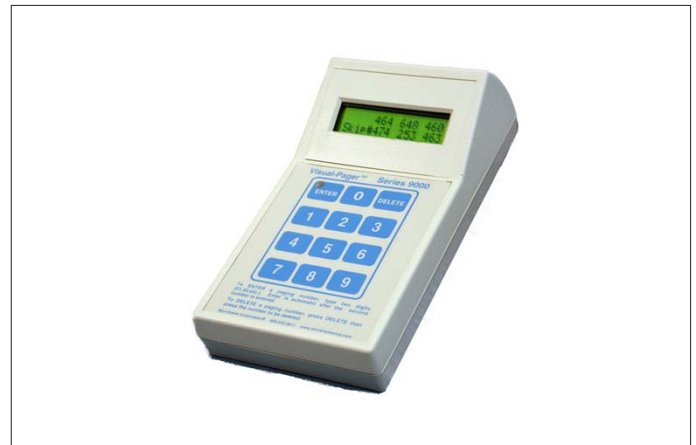
Microframe® Model 9040 Keypad

The Model 9040 Keypad is designed to accept numbers typed into the keypad and display them on a Remote Display. Up to 32 different 3-digit numbers will be remembered and rotated on a customer programmed time schedule; i.e. every three seconds. The Keypad will display four different 3-digit numbers at one time and change to a new set of four numbers every three seconds. This allows the Keypad to show all 32 numbers within a 24-second period (4 numbers every three seconds). The Model 9040 Keypad can automatically delete each number after a user-programmed display time from 1 to 99 minutes. The keypad can blink numbers at two different rates after they have been entered a user programmable length of time.