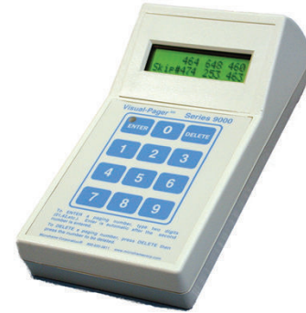
Microframe® Model 9040 Keypad

The Model 9040 Keypad is designed to accept numbers typed into the keypad and display them on a Remote Display. Up to 32 different 3-digit numbers will be remembered and rotated on a customer programmed time schedule; i.e. every three seconds. The Keypad will display four different 3-digit numbers at one time and change to a new set of four numbers every three seconds. This allows the Keypad to show all 32 numbers within a 24-second period (4 numbers every three seconds). The Model 9040 Keypad can automatically delete each number after a user-programmed display time from 1 to 99 minutes. The keypad can blink numbers at two different rates after they have been entered a user programmable length of time.