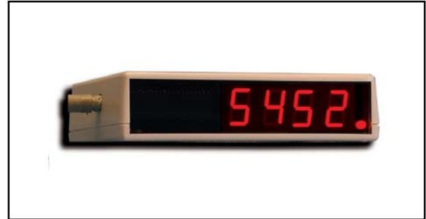
Microframe® Model 941 and 942 Display

The Model 941 Desktop Remote Display is designed to operate with the Microframe Model 6200 Timer or Model 904 Keypad to provide a Remote Display of data entered into these products. The Model 941 Display receives its power and signal from a single cable connected to the Keypad and is turned on or off with the Keypad power switch.