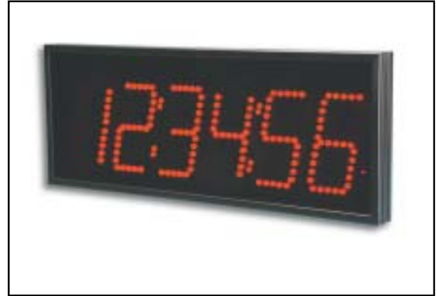
Microframe® Model 960 Display

The Remote Display is designed to operate with the Model 906 Keypad or Model 6200 Timer Keypad. The Remote Display receives power and signal from a single cable connected to the Keypad and is turned on or off with the Keypad power switch. This Display is used to show hours minutes and seconds from both timers on the 6200 Keypad.