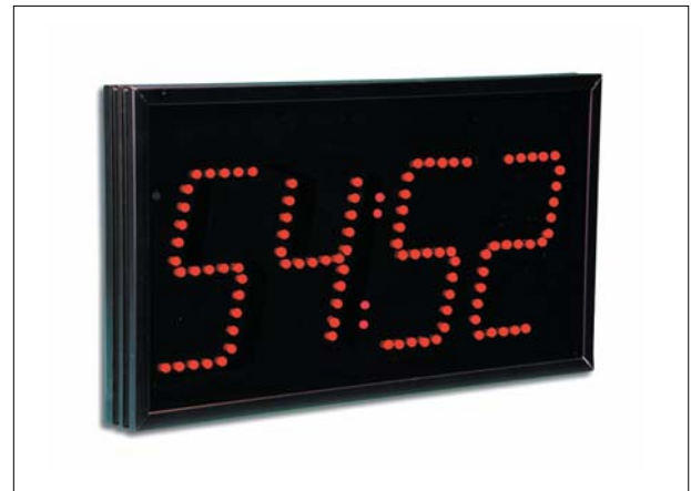
Microframe® Model 940 Display

The Remote Display is designed to operate with the Model 904 Keypad or Model 6200 Timer Keypad. The Remote Display receives power and signal from a single cable connected to the Keypad and is turned on or off with the Keypad power switch.