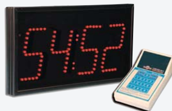
Count Up/Down Timer