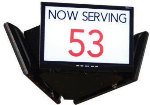
5313 LCD Display

The Model 5313 - LCD Take-A-Number System with 3 LCD monitors and ethernet connectivity - This system will connect to your local computer network. This allows you to change the look of the numbers as well as the upsell content from any computer on your network. Microframe took the popular Take-A-Number System and combined it with an LCD Digital Picture frame to bring you the LCD Take-A-Number System. This provides an effective solution for managing customer service flow and the ability to advertise, inform, and educate your customers with one product. Supplement your advertising, increase brand awareness... your options are endless!