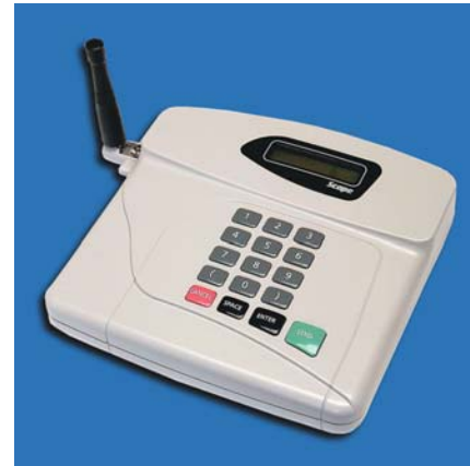
DataPage II w/DTMF Transmitter

The DataPage II w/DTMF can send a 12-digit numeric message code to any of 9,999 different pagers. When used with the GEO 40 Alpha Pager, Microframe can program pre-defined alpha messages to enhance communication between the sender and receiver. Up to 874 total characters may be used, making it possible to program as many different messages as you want within that character limit. Every space counts as a character, as does every line. For example, you could pre-define 45 messages that are 2-5 words in length or 70 two-word messages. All pre-defined messages are programmed at the time of initial order.