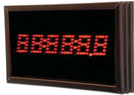
Microframe® Model A0262 Display

The computer passes ASCII characters and a carriage return (ASCII 13D), and then the characters will be displayed on the Model A0262. To display a blank screen, pass a carriage return (ASCII 13D). Insert the decimal point in the number string and it will light. Pass a colon (:) and the right colon on the Display will light. Pass a percent sign (%) and the left colon will light. Leading zeros will be blanked if the user selectable option switch is enabled.