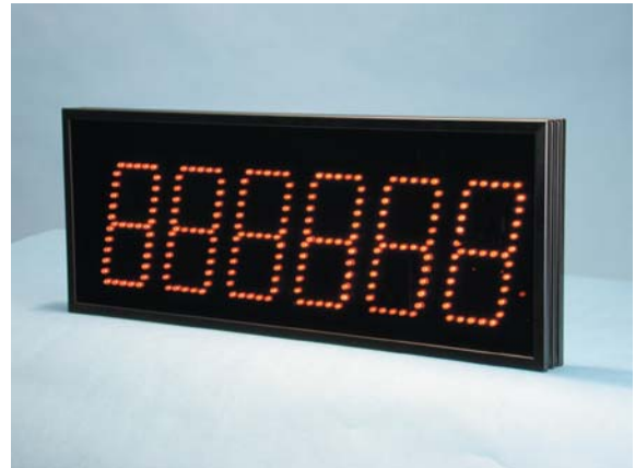
Microframe® Model 260 Display

The computer passes numbers and a carriage return (ASCII 13D), and then the numbers will be displayed on the Model 260. To display a blank screen, pass a carriage return (ASCII 13D). Insert the decimal point in the number string and it will light. Include a colon in the number string to light the colon for that number. Leading zeros will be blanked if the user selectable option is enabled.