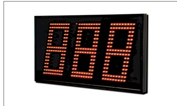
Microframe® Model 1030 Display

The Model 1030 Remote Display is designed to operate with the Microframe Model 904 Keypad to display 3-digit numbers.